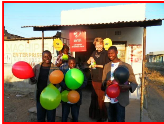
Ready for the party!