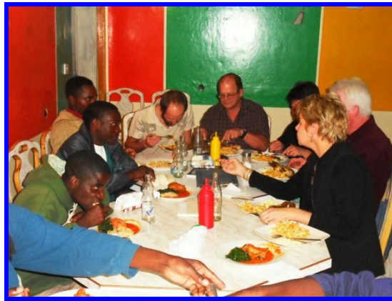
A big celebration!