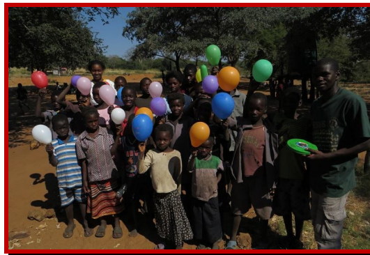
21 New orphans at the local school

Dit is maar een van die talle stories wat ons hoor waar sangomas betrokke is. Julle moet asb nie ophou bid nie, vir ons, en vir die plaaslike bevolking wat nog so vasgeketting is aan hierdie sataniese praktyk wat so 'n ewel in God se oë is nie.