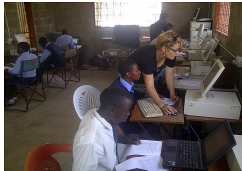
Below: The first ICT exam at Zamulimu!