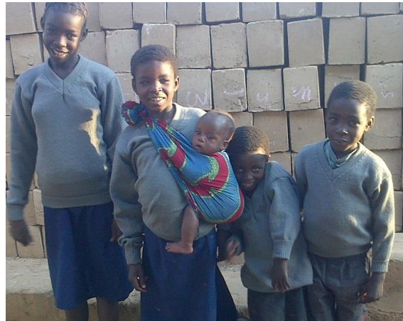
Above: the four orphans with new jerseys