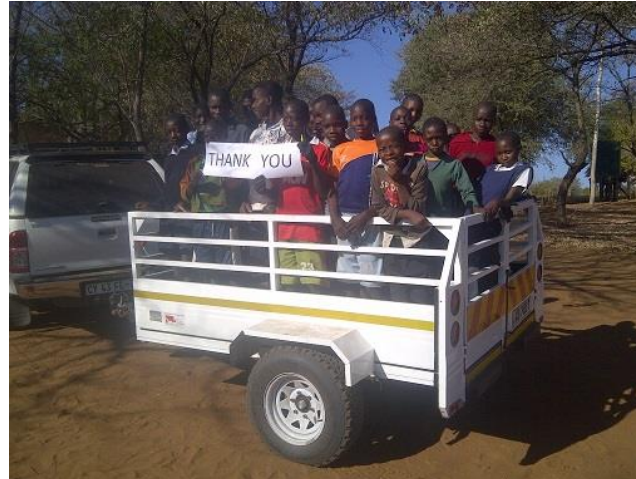
Below: Thank you for the new trailer