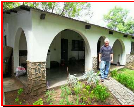
The flat we are renting on a farm near Choma