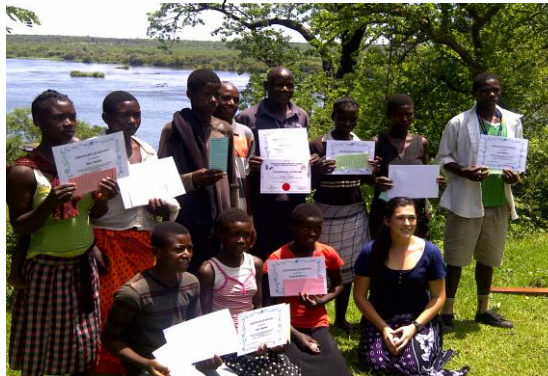
Below: Baptism of new believers