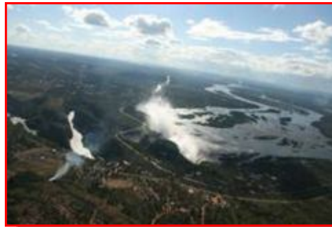
Zambezi-rivier in vol vloed Zambezi River in full flood