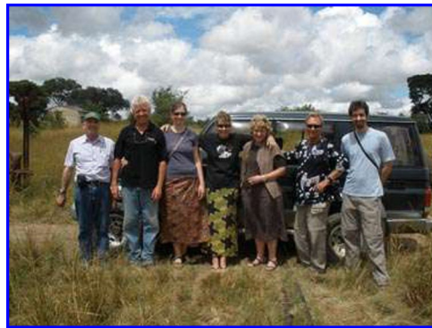
Ferreira's & 'Helping Hands'-besoekgroep Ferreira's & 'Helping Hands' visiting group