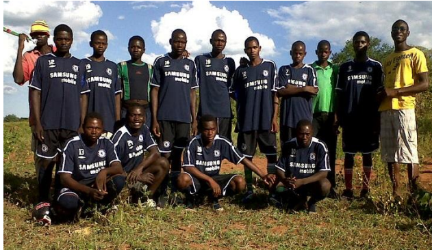
Above: Our local soccer team!