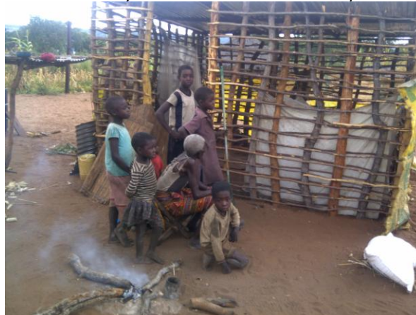
Below: Newly built house for our 4 little orphans

hulp van plaaslike werkers, het daar 2-groepe van die Wellknown Kerk uit SA kom hand bysit met die bouery. Ons kan net in totale verbasing staan oor wat gebeur het in die tyd wat ons nie eers hier was nie! Baie dankie aan 'n ieder en elk wat 'n deel bygedra het tot hierdie wonderlike gebou!